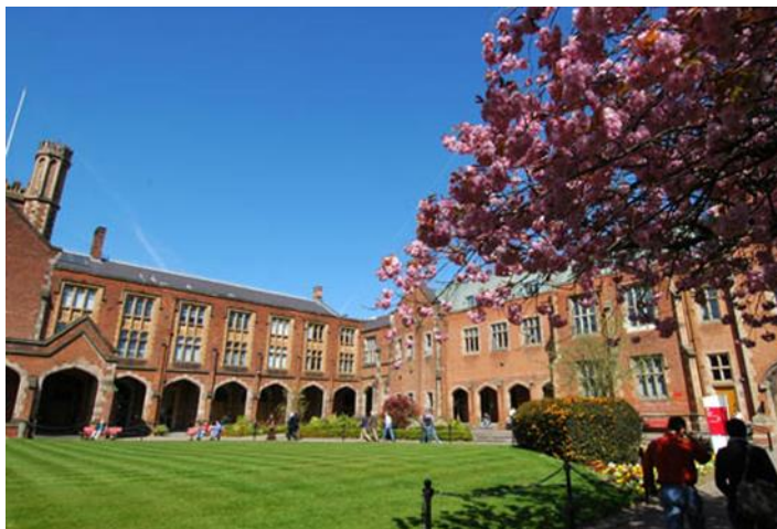
Figure 27. Image of the Quadrangle.

By the early twentieth century, the north and east sides of the quadrangle had been completed in a variety of traditional styles. These buildings were subsequently demolished to make way for the Peter Froggatt Centre and the Administration building. Despite the very modern style of these buildings, their low height and use of red brick tradition maintain the scale and enclosure of the quadrangle.