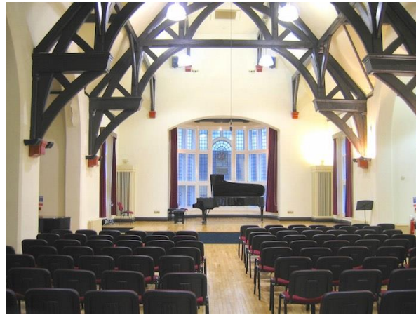
Figure 24. Image of the Harty Room.

It is now used for musical performances and events.