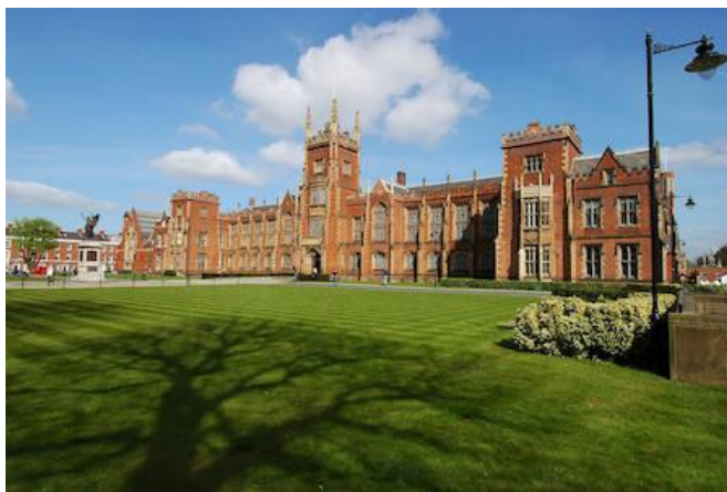
Figure 2. The Lanyon Main Site is open to the public seven days a week.

The Lanyon Main Site (incorporating University Square) consists of several well-maintained open green spaces comprising of lawns, flower beds and borders, in an otherwise densely populated urban area. A considerable proportion of the site is pedestrianised. The green space is set against the impressive Lanyon building, a Grade A listed building maintained and preserved to the highest standards. The Lanyon Main Site has been designed to ensure the site is both visually striking and welcoming. A number of buildings are located within the site and are used for teaching, office space, research, meetings and functions. Several of the buildings that are located on the Lanyon Main Site are of significant architectural merit.