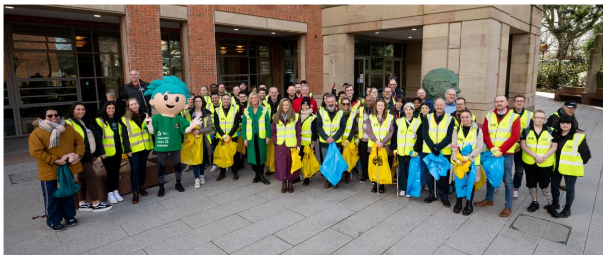
Figure 29. Staff, students and the local community taking part in Queen's Big Spring Clean.

Over the course of the year, staff, students and local community come together to undertake litter pick and clean up the streets particularly in the residential areas immediately adjacent to the University.