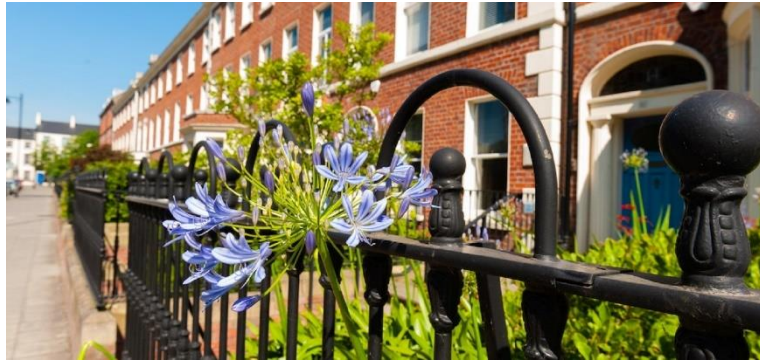
Figure 29. Image of University Square.