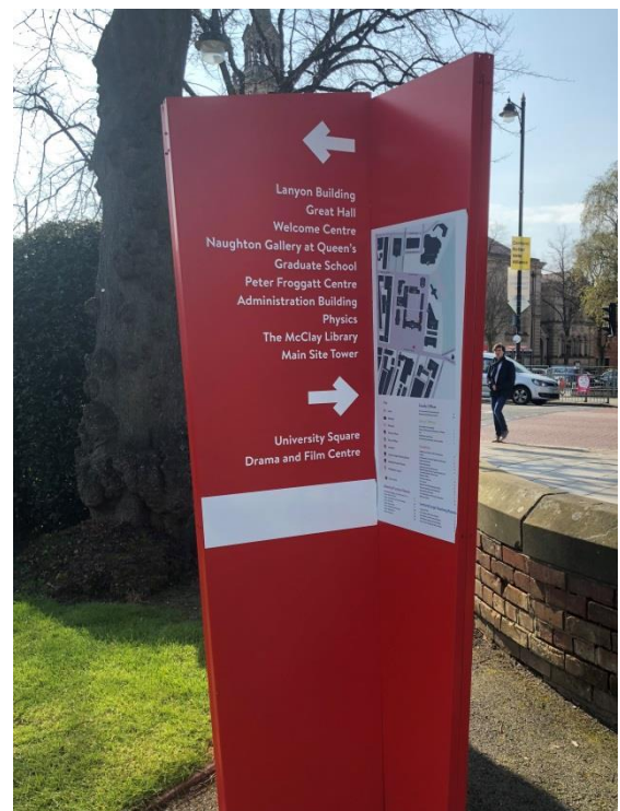
Figure 4. Five information signs are found throughout the Lanyon Main Site.

There are two security gatehouses located at the two main public entrances acting as a welcome and information point for visitors and site users. These are attended by a member of the