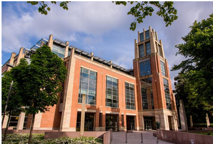
Figure 25. Image of the McClay Library

The building has achieved a number of awards including the Royal Institution of Chartered Surveyors Award for Sustainability in 2010.