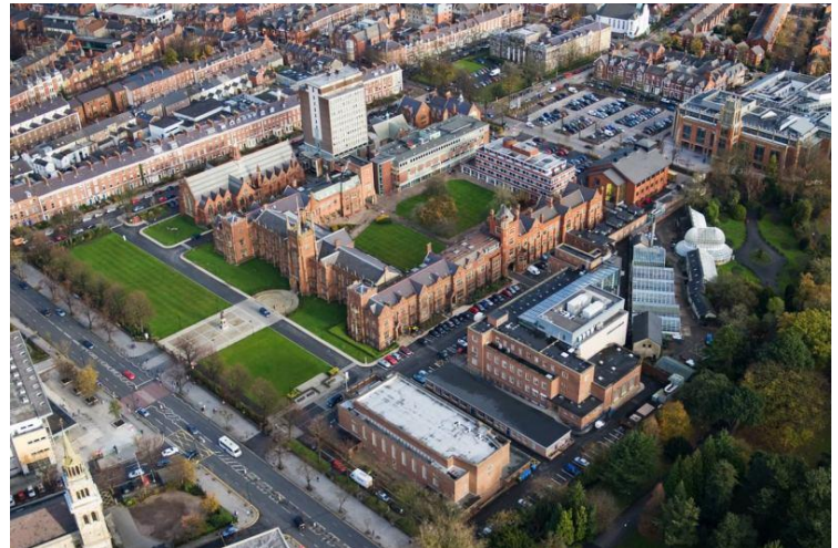
Figure 19 and 20. Aerial image of the Lanyon Main Site in 1919 and in 2017.

The following section provides an overview of architectural heritage of the key buildings located on the Lanyon Main Site.