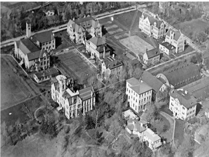
Figure 19 provides an aerial photograph of the University in 1919 and Figure 20 provides an aerial photograph of 2017.

The site also contains a number of modern buildings which have been recognized as being of high architectural merit. These include the Main Site Tower and the McClay Library.