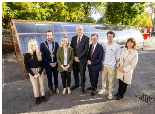
Figure 3. Launch of new all-inclusive, cycle parking infrastructure in October, 2024.

In partnership with Belfast City Council and Department of Infrastructure the University has installed a new, all-inclusive, cycle parking infrastructure at Queen's University Belfast main car park. It can hold 55 bikes and contains a battery charging cabinet for e-bikes.