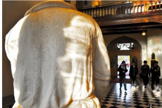
Figure 22. Image of the Black and White Hall.

The Black and White Hall, can be found through the main doors of the Lanyon Building. The central statue of Galileo, by Pio Fedi, was installed in the hall in 2001 as part of the restoration of the adjacent Great Hall.