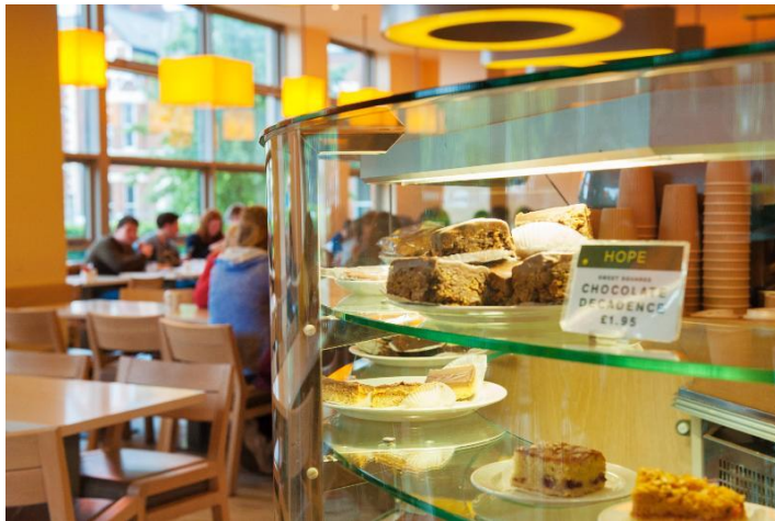
Figure 5. Image of Café Hope, located within the McClay Library, the Lanyon Main Site.

There are two café's located within the Lanyon Main Site, Junction (Main Site Tower) and Hope Cafe (McClay Library). These are operated by external University partners and are available to the general public. Further details on café provision can be found here .