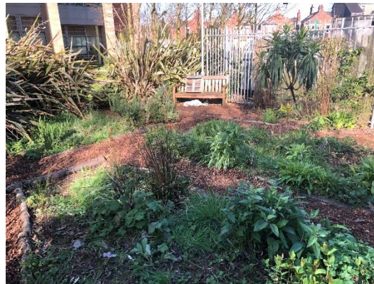
Figure 12 and 13. Image of the McClay Library Sound Garden.

Since 2023, interconnected biodiversity projects have taken place within internal courtyards located along University Square, entitled 'Pockets of Green Space'. These projects have been funded by Queen's Green Fund and are implemented in collaboration with staff in University Square and the Estates Directorate. Three courtyards have been completed to date.