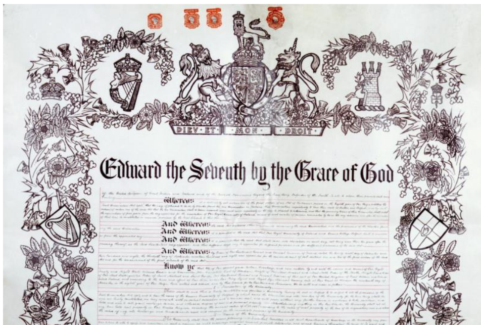
Figure 18. Queen's University Belfast Royal Charter.

Queen's is the ninth oldest University in the UK, founded by Royal Charter in 1845 (Figure 18). Founded by Queen Victoria, the Queen's University in Ireland, was designed to be a non-denominational alternative to Trinity College Dublin which was controlled by the Anglican Church.