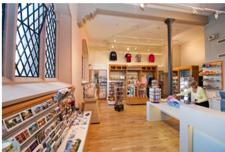
Figure 6. Image of the Welcome Centre.

Staff within the Welcome Centre provide guided tours, which include viewing the Great Hall, Canada Room, School of Music and Quadrangle.