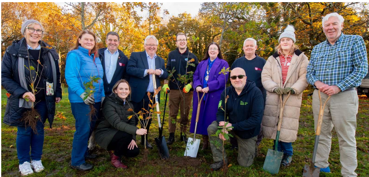
Figure 31. Planting of 400 Lennoxvale Tree Nursery saplings in Malone Playing Fields in November 2022.

Approximately 600 of these saplings have been planted within Queen's campus as part of the Million Trees for Belfast Initiative.