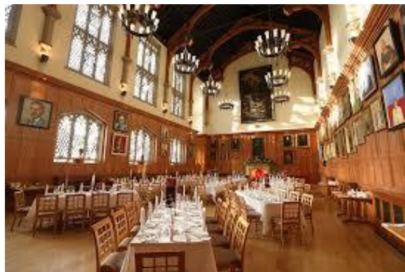
Figure 21. Image of the Great Hall

The most dramatic space in the University, the Great Hall houses portraits of many inspiring and influential Queen's people. The Great Hall was inspired by the medieval great halls found in colleges in Cambridge and Oxford. Many of the intricate features originally planned for the hall were cut out due to budget constraints and were added during an extensive £2.5m renovation in 2002, which restored it to Lanyon's original plans. Further renovations in 2018/19 have further enhance this space.