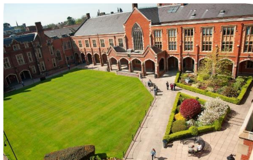
Figure 10. Image of the Lawns at the Lanyon Main Site.