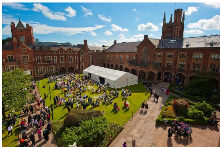
Figure 30. Summer Graduation in the Quadrangle.