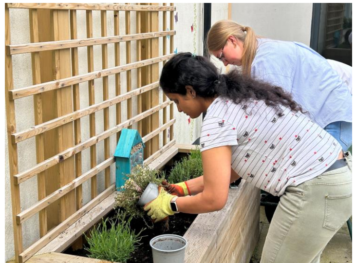
Figure 14 and 15. Images of 'Pocket of Green Spaces' project along University Square.