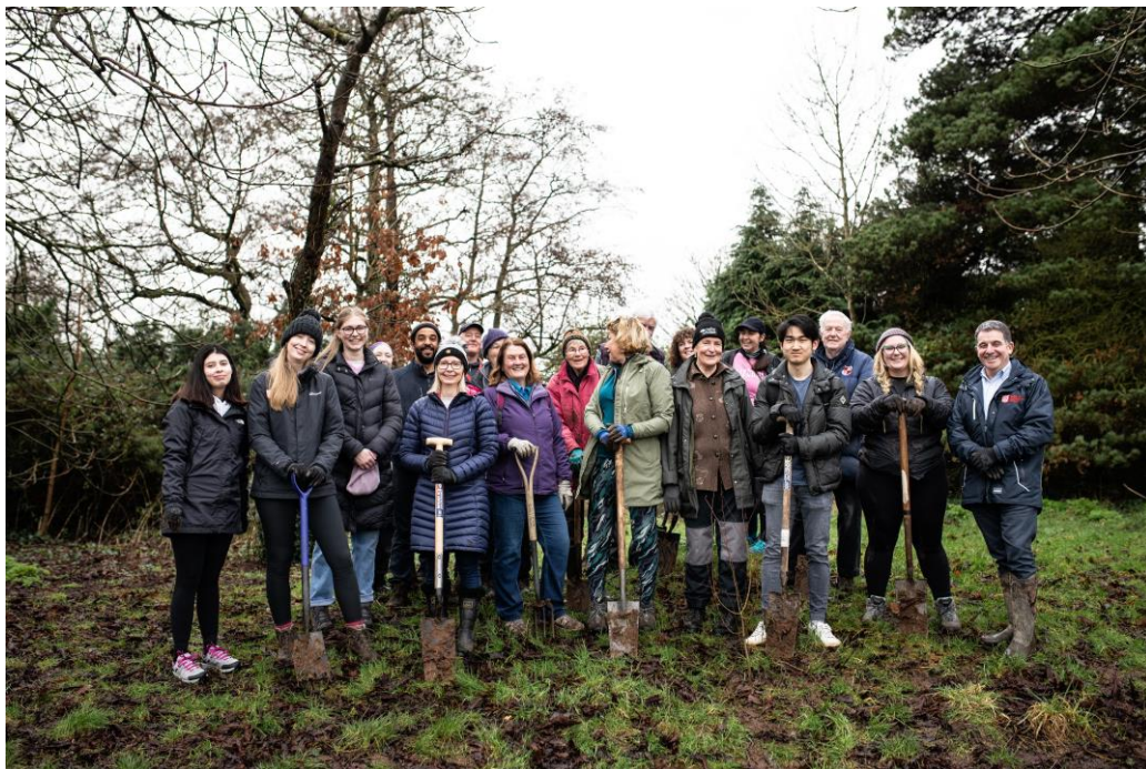
Figure 11: Tree planting at Malone Playing Fields, February 2024.

The University has six 'no mow' areas across campus. Our 'no mow' areas are only cut twice a year (April and September), ensuring our insects are provided with food and a habitat throughout the Spring and Summer period. In April 2024, a new 'no mow' area was established outside our Physical Education Centre, resulting in Queen's having over 7000m 3 of rich biodiversity grassed area. This action was taken as part of our commitment to becoming supporters of the All Ireland Pollinator Plan.