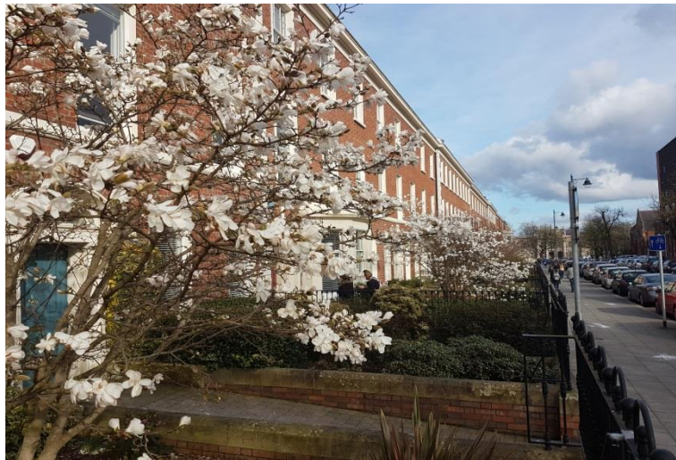
Figure 9. The Lanyon Main Site contains a number of Magnolia Trees.