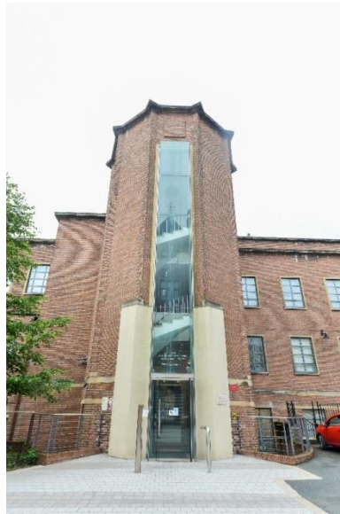
Figure 28. Image of the Physics Building.

until 1958 and then opened in 1962. It was recently refurbished in 2017. This is a large building, simply detailed but with good massing and a wonderful stairway in the entrance tower. Although distinctively different from the original buildings, and the prevailing Tudor detailing of practically every other building constructed right up until the 1930s, the red brick and stone detailing and the relatively low heights allow it to remain respectful, with a quiet grandeur.