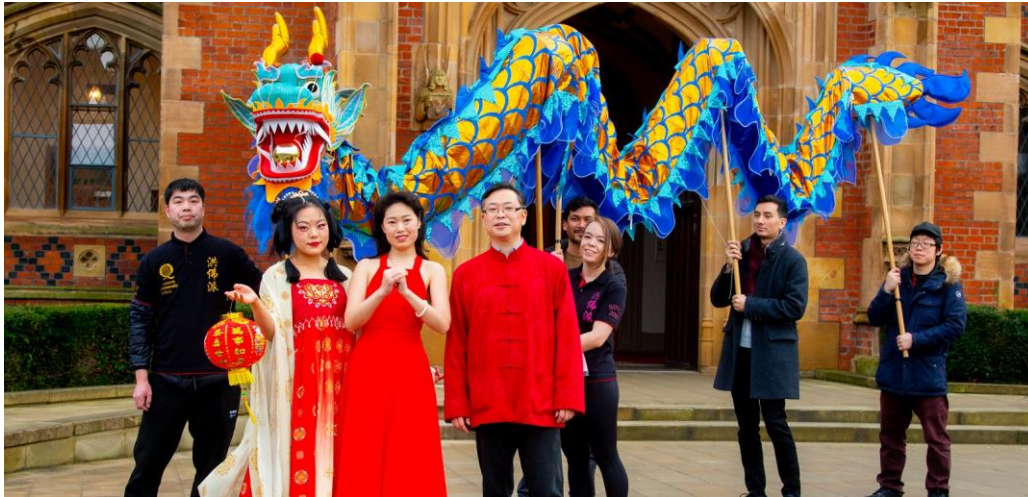
Figure 30. Chinese New Year 2022.