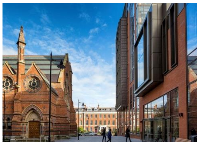
Figure 26. Image of the Main Site Tower.

The building integrates impressively with the adjacent Gothic and Tudor style library and music school.